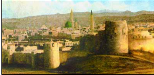
Old Medina Castle

L AİKİZ! Soru: Ne zaman LAİK olduk? Niçin MÜSLÜMANIZ bize dedirtmediler? LAİKLİK ne demektir? Bilenimiz var mıdır? Var ise, çıksın ve Laikliğin tarifini ve ne demek olduğunu bize anlatsın. Laiklik bir DİN veya İnanç mıdır? Yoksa Laiklik bir devlet ideolojisi midir?! Öyleyse, Laiklik ideolojisi hangi düşünce, veya inanç sistemine bağlıdır? Nereden gelmiş? Hangi tecrübe ve analizden geçmiştir? Laiklik Garptan